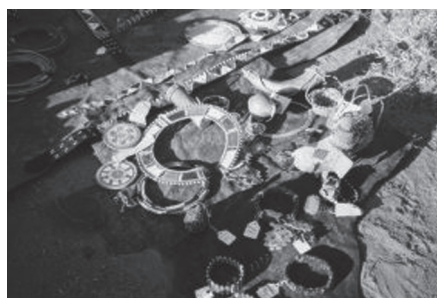
The Maasai women can make a livelihood selling handmade jewellery to tourists