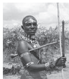
Young Maasai warrior

The Maasai people are famed for their rich and colourful culture. There are numerous traditions and ceremonies performed by Maasai men. Perhaps best known is the warrior 'jumping' dance, where young Maasai demonstrate their strength.