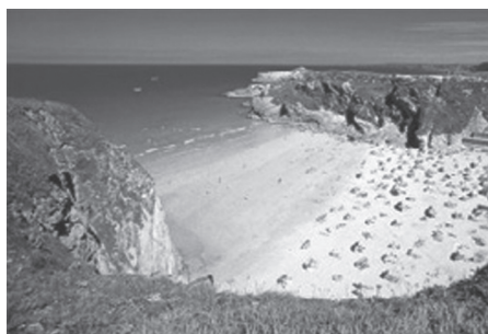
Lusty Glaze Cove

Besides water sports and surfing, Newquay has a variety of attractions suitable for families including Newquay Zoo, the Blue Reef Aquarium, Dairyland Farm World, Holywell Bay Fun Park and Springfields Pony Centre and Fun Park. The town has a wide selection of caravan parks, self catering flats, campsites, numerous hotels, bed and breakfasts (B&Bs) and guesthouses.