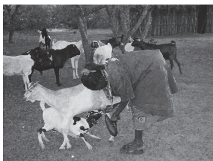
Goat and cattle are central to Maasai way of life