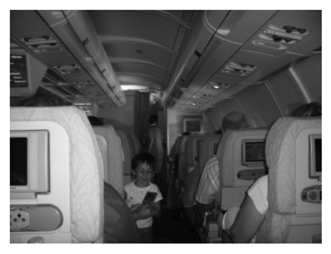
Fig. 3a Emirates flight from Dubai