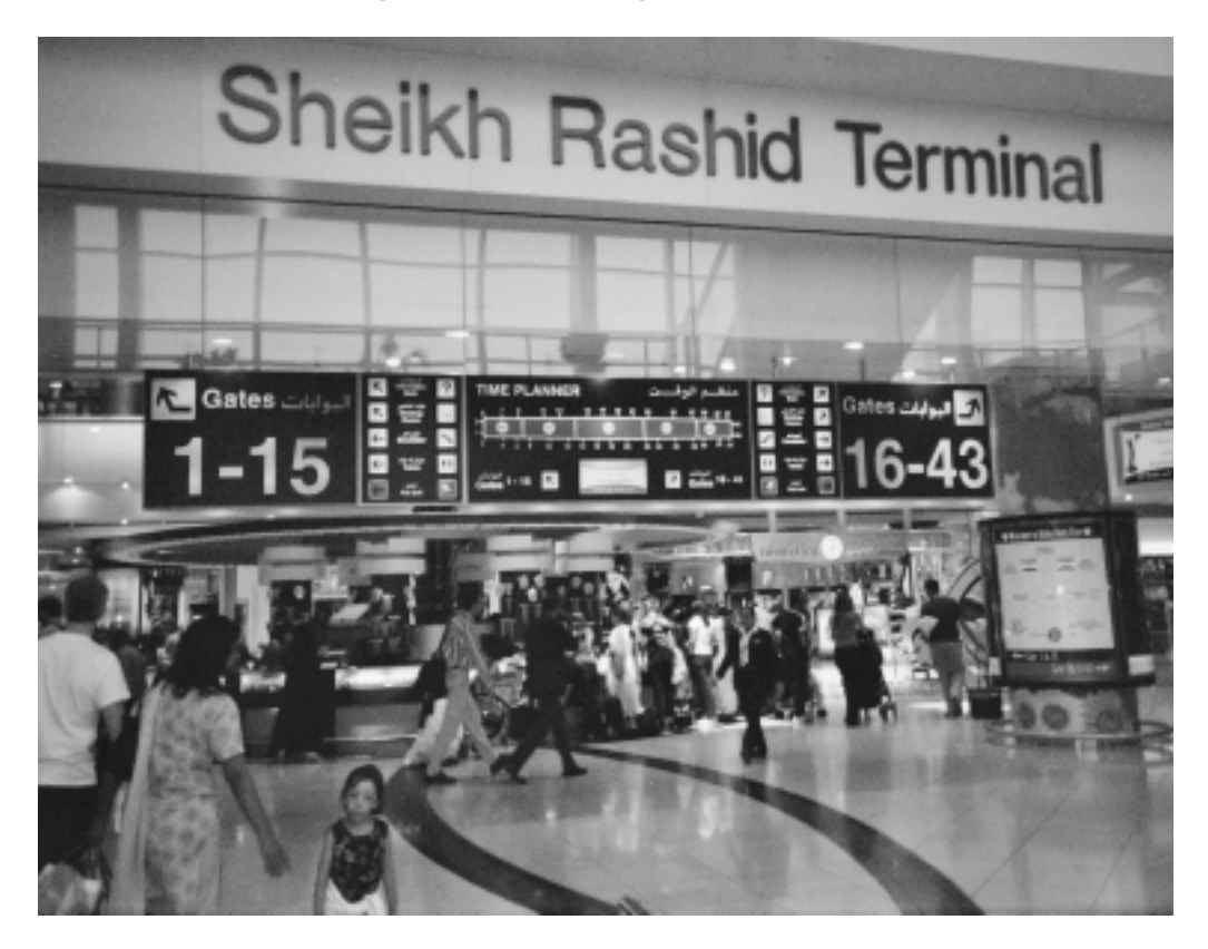
Fig. 3b Dubai Airport