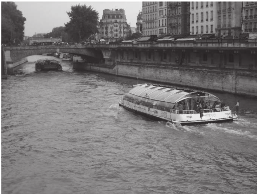
Boat Trips on the River Seine, Paris