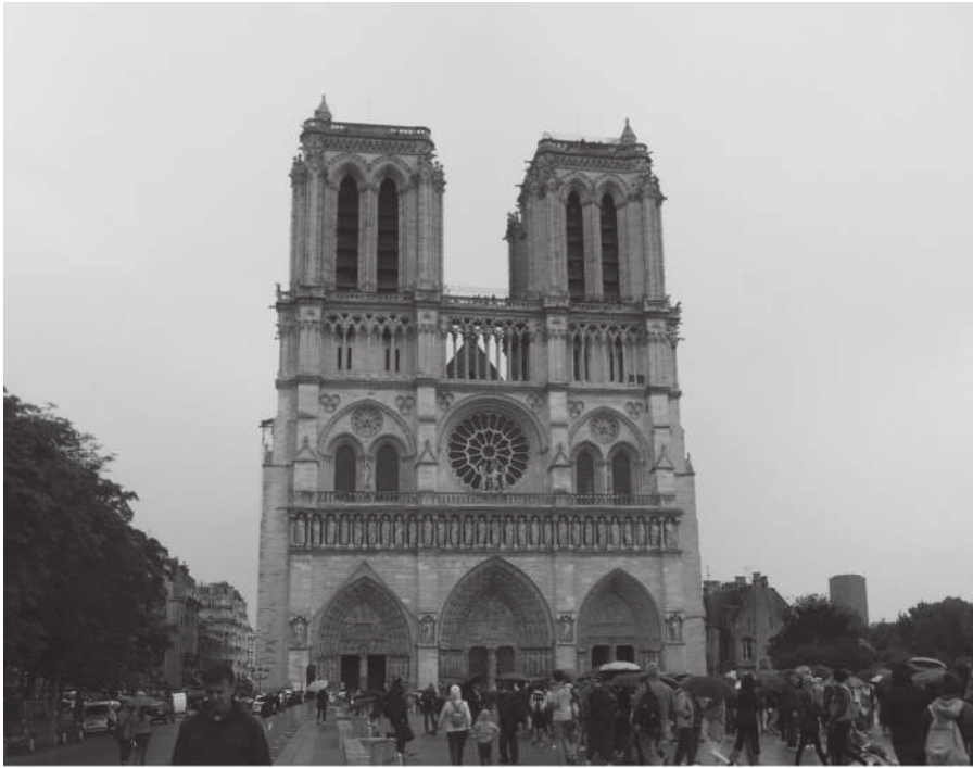
Notre Dame Cathedral, Paris