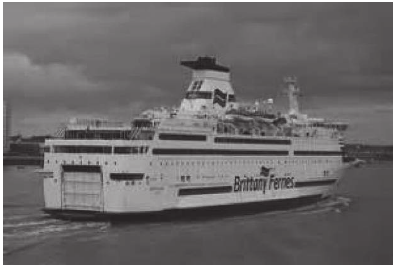
Fig. 3 for Question 3