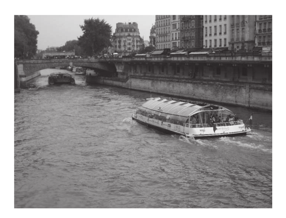
Boat Trips on the River Seine, Paris