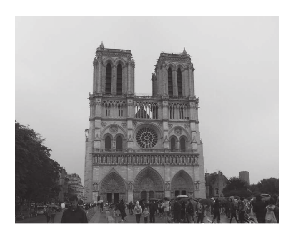
Notre Dame Cathedral, Paris