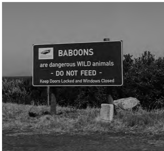
Fig. 2 for Question 2