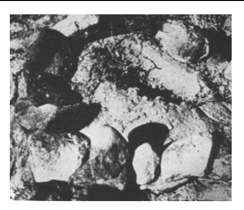
One of the four impressions found at the Socorro site.