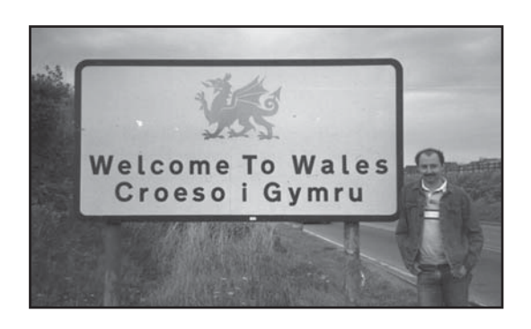
Option 3: Community and Culture