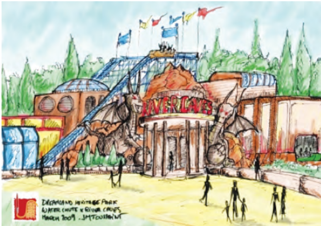
An artist's impression of the new-look Dreamland Pleasure Park

Margate was one of the UK's most popular seaside resorts but visitor numbers gradually declined over many years. However, the town's main visitor attraction, Dreamland Pleasure Park, has now been fully renovated and the town is seeing an increase in visitor numbers.