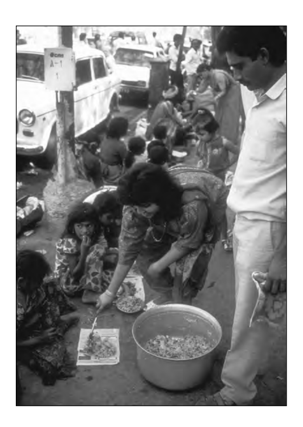
Source A – A Hindu woman distributing rice to poor people in Mumbai

This question is about similarities and differences of attitudes, values and beliefs. Study Source A and then answer the question that follows.