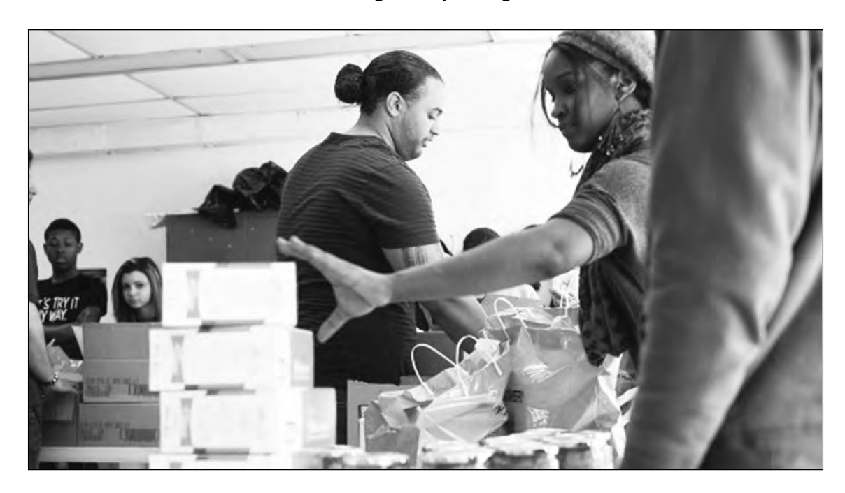
Source A – Volunteers creating food packages at a Passover food bank

This question is about similarities and differences of attitudes, values and beliefs. Study Source A below and then answer the question that follows.