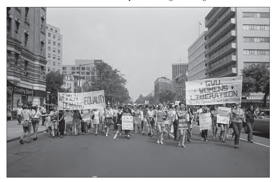
Source A - A Women's Liberation protest through Washington DC in 1970.

This question is about the different influences on people's lives in the USA after 1945. Study Source A and then answer the question that follows.