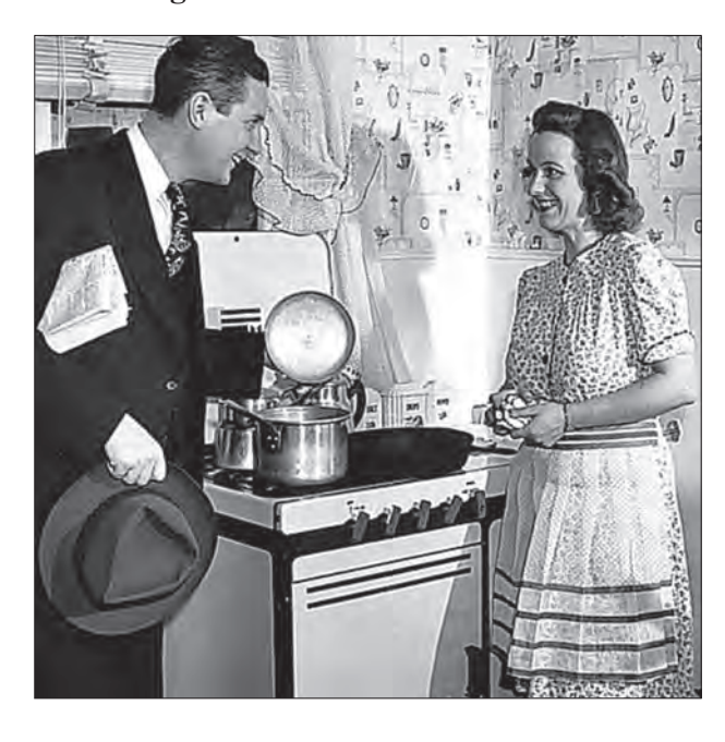
Source \ B-A \ photograph \ from \ the \ Daily \ Mail \ newspaper \ in \ the \ 1950s \\ showing \ a \ husband \ and \ wife \ in \ the \ kitchen.

Study Source B and then answer the question that follows.