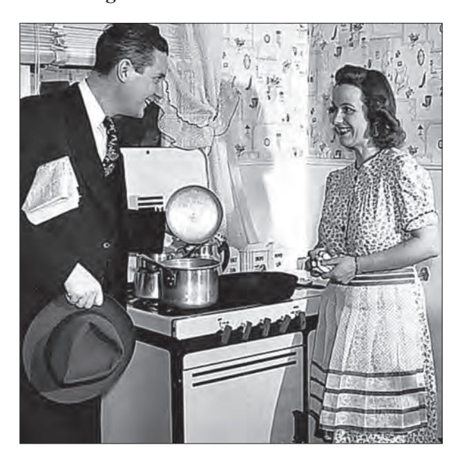
Source \ B-A \ photograph \ from \ the \ Daily \ Mail \ newspaper \ in \ the \ 1950s \\ showing \ a \ husband \ and \ wife \ in \ the \ kitchen.