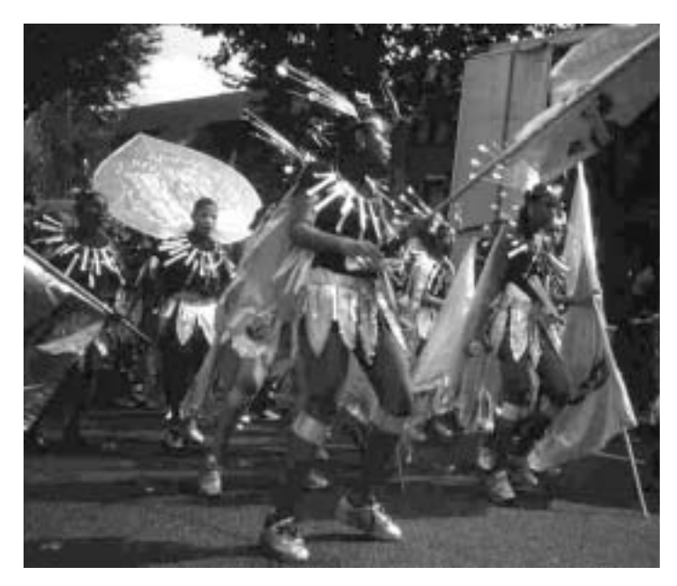
The Notting Hill Carnival is held every year and has become a traditional part of West London life.