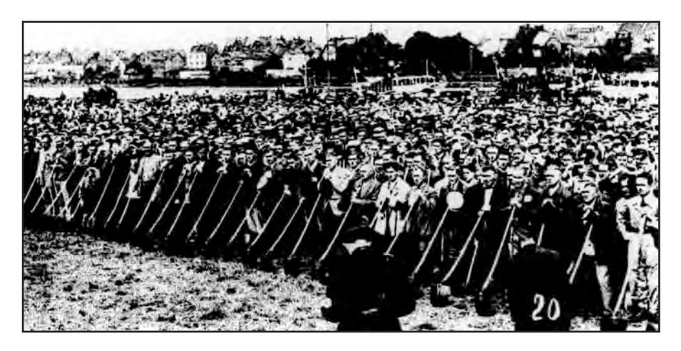
[A photograph of previously unemployed workers meeting to build the first autobahn, (September 1933)]