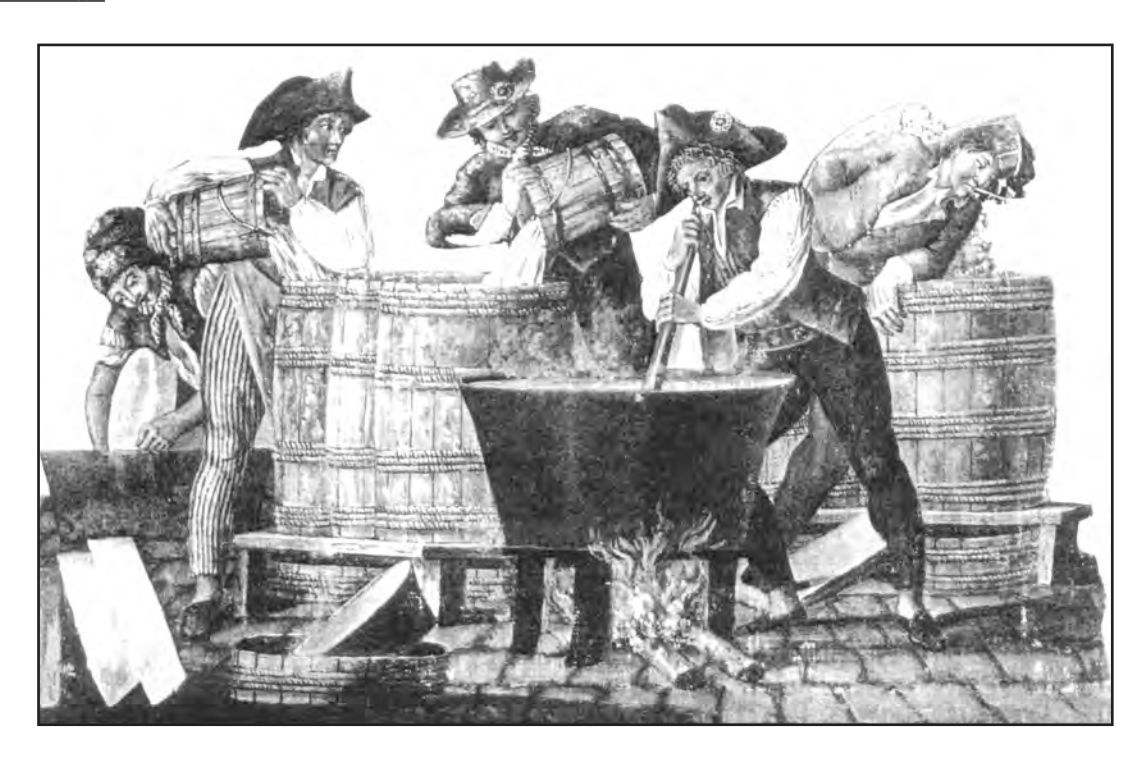
[A contemporary print showing sans-culottes making saltpetre for the army (c. 1794)]