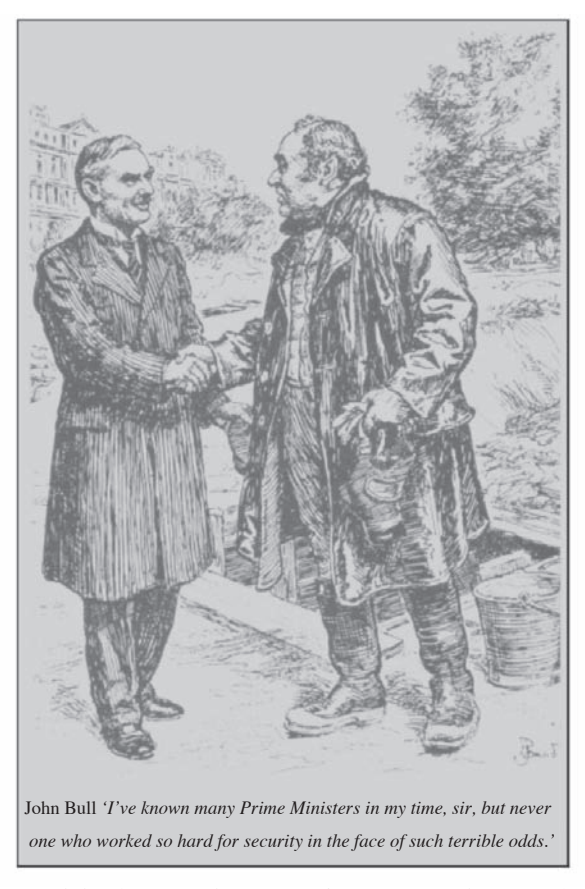
[A cartoon from the satirical magazine Punch , commenting on the country's gratitude to Neville Chamberlain (1938)]