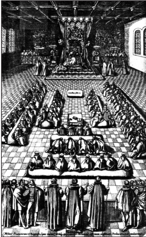
[From a contemporary drawing showing the State opening of Parliament (1563)]