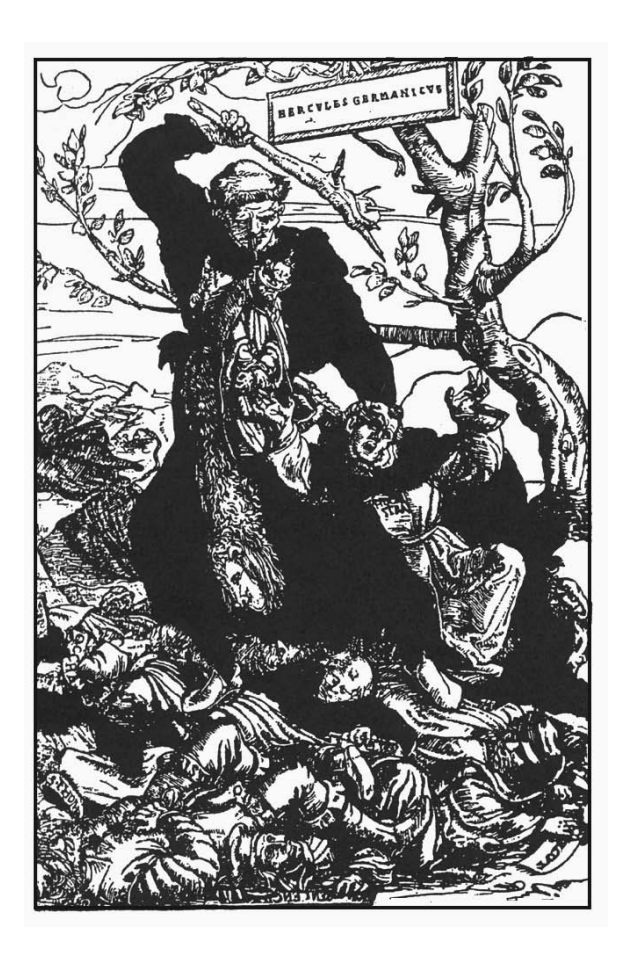
[Luther shown as Hercules Germanicus , a critical contemporary cartoon by Hans Holbein the Younger (1528)]