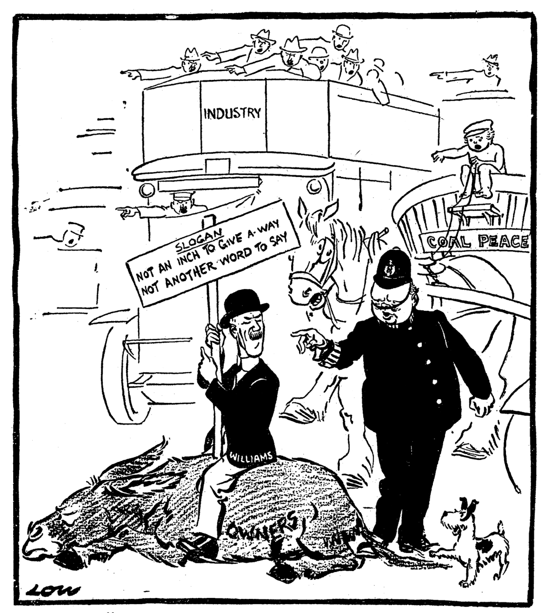
"The Whole Town's Talking"—Move On!

Cartoon, London Evening Standard, 9 September 1926