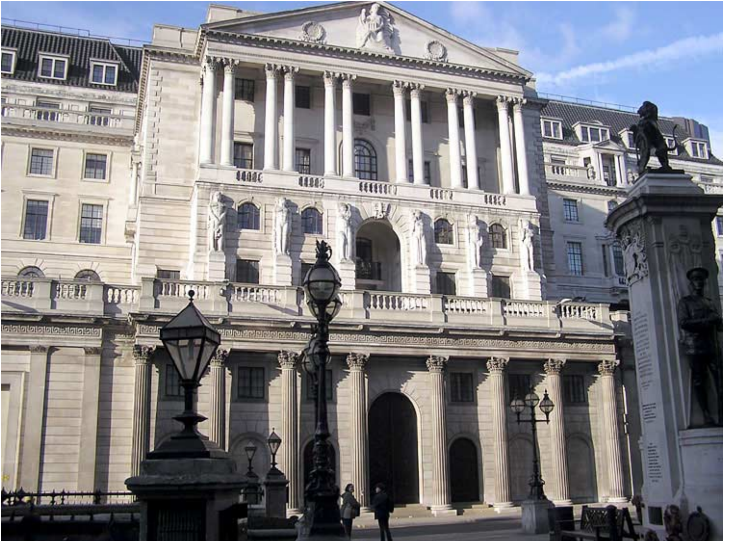
Sir Herbert Baker, The Bank of England , (1929-1935) London, stone,