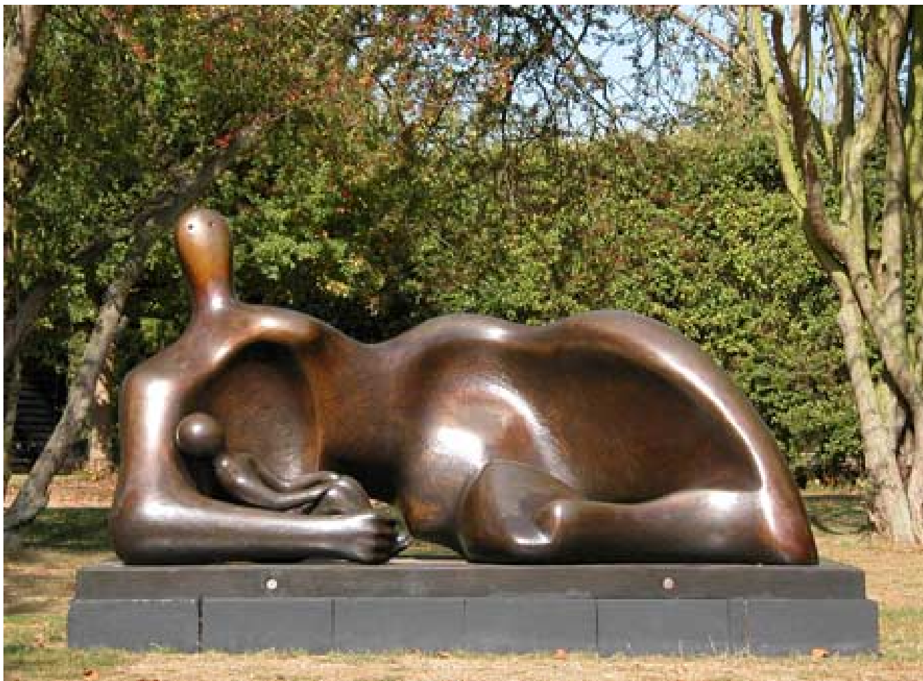
Henry Moore, Draped Reclining Mother and Baby (1983), bronze, length 265.5cm, Perry Green