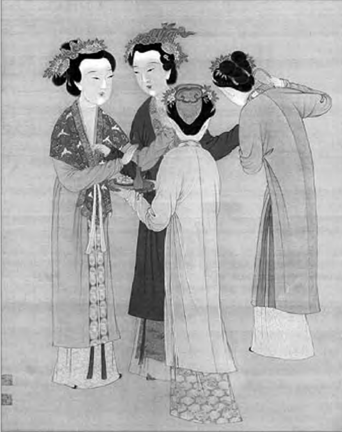
'Four Beauties', a Ming Dynasty painting

Extract adapted from an article on an English-language website sponsored by the Chinese Ministry of Culture