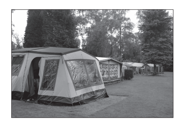
Im Wohnwagen oder im Zelt:

Campingurlaub ist preiswert und familienfreundlich.