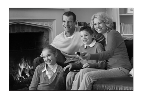
Gemeinsam Sendungen ansehen