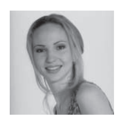
"Nur in modischen Klamotten