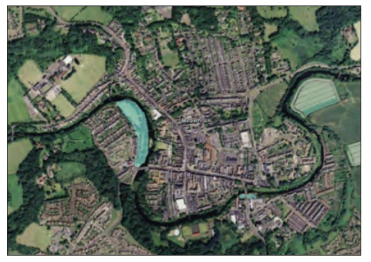
Figure 3: Computer model of flood risk of the River Wansbeck, Northumberland