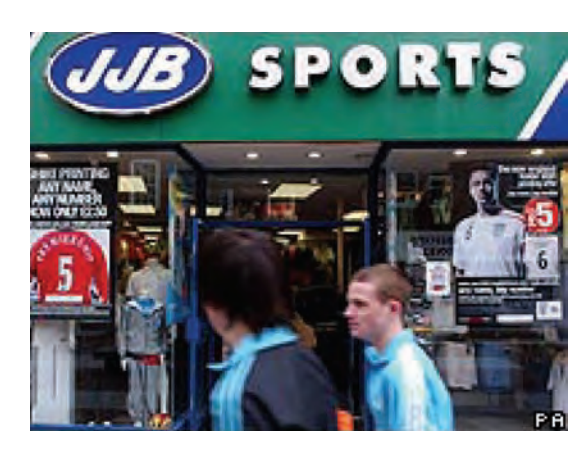
JJB is cautious about the future.

The loss came as sales fell 5.6%. Looking ahead, the group said it remained very cautious about the future amid the current consumer slowdown.