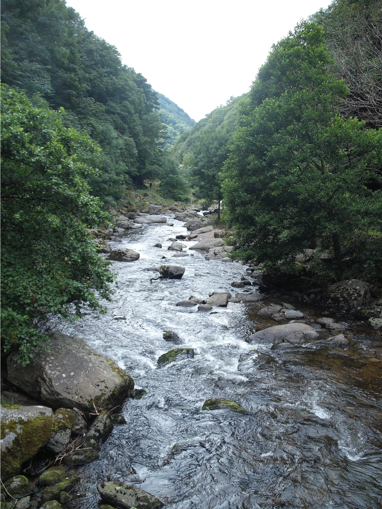
FIG. 1 THE EAST LYN RIVER, DEVON