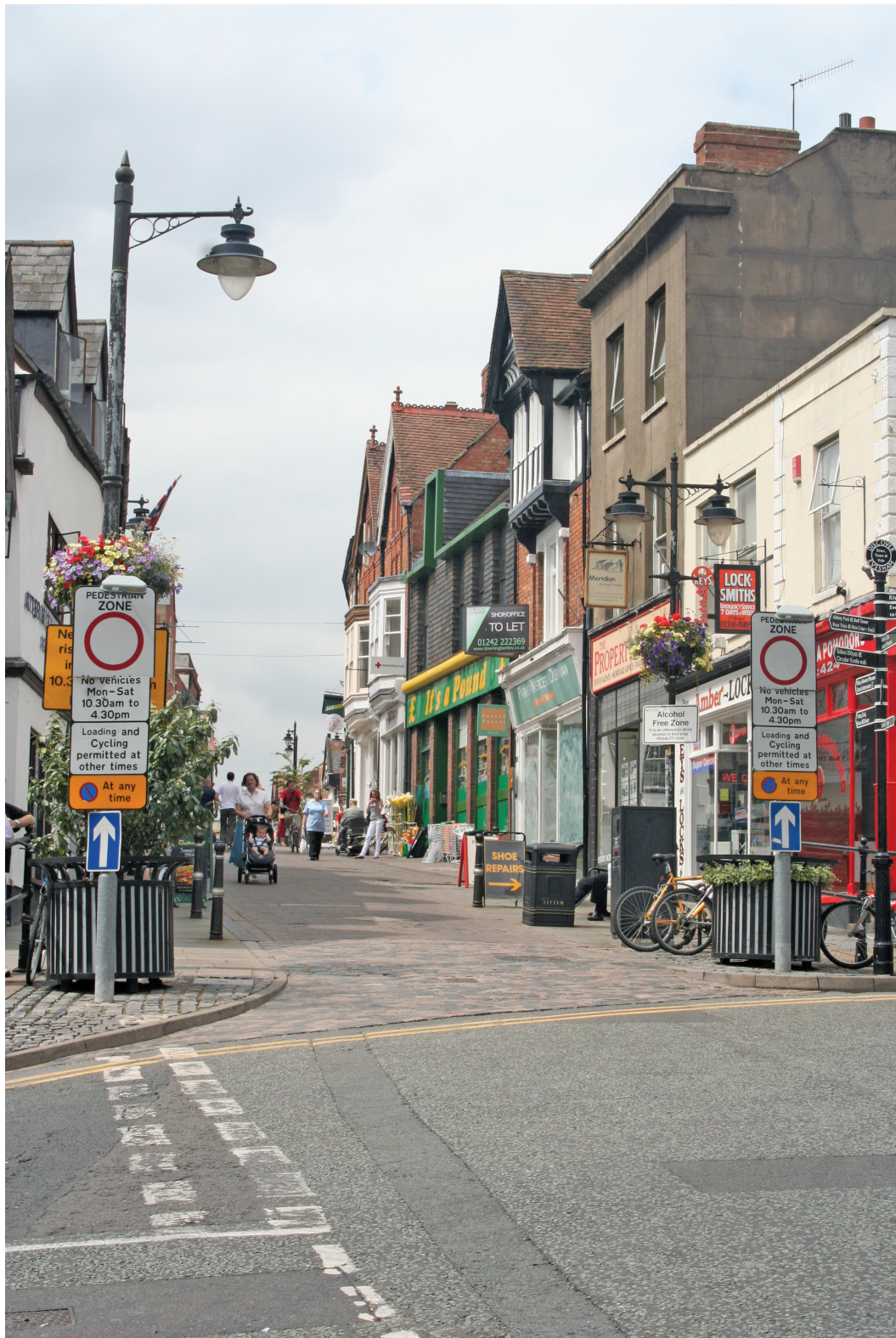
Fig. 3 Photograph of part of the area used for a geographical investigation