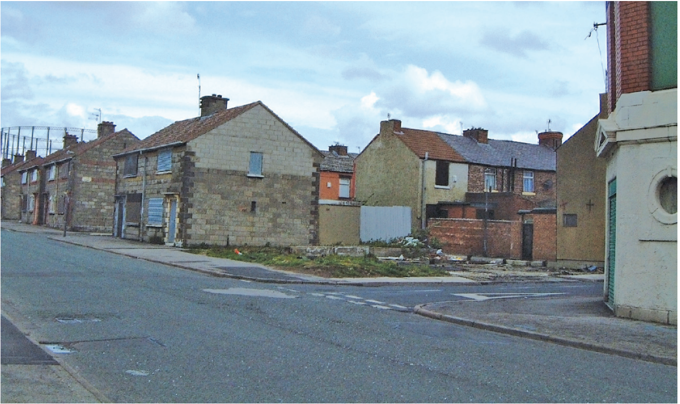
Fig. 2 A rural area in Wales