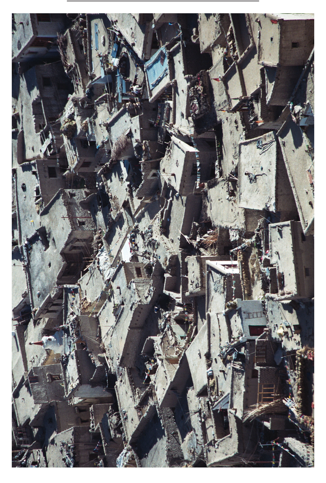
FIG. 1 AN URBAN AREA IN INDIA