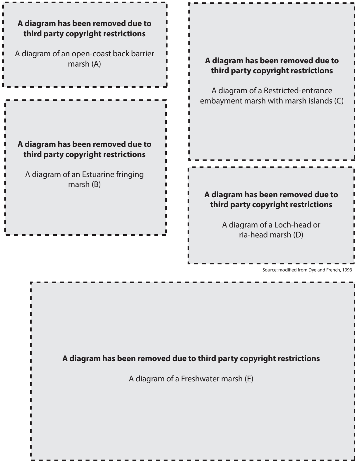
Fig. 3 Coastal Wetlands

Source: modified from Dye and French, 1993