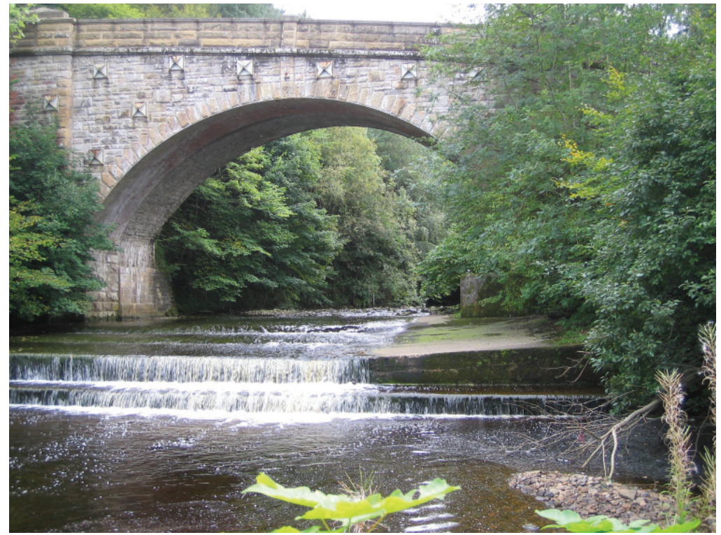
Fig. 2 Location on a river requiring risk assessment