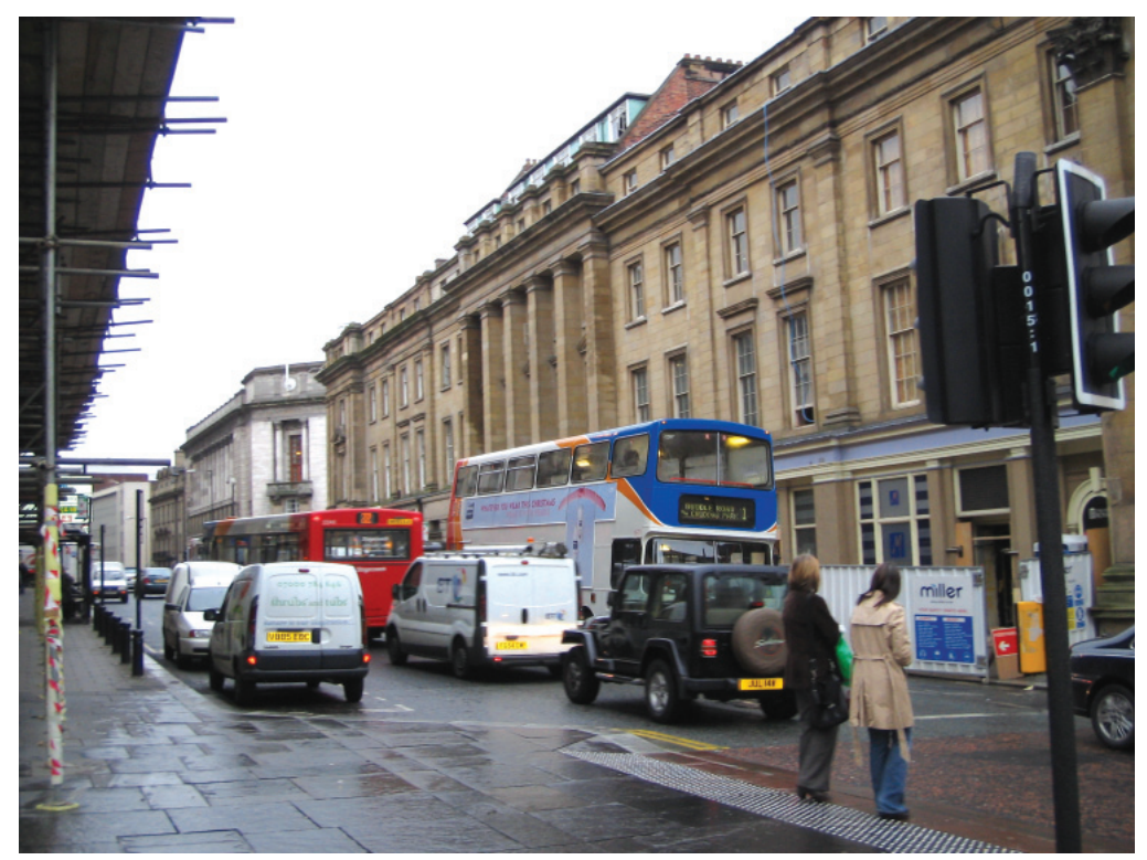
Fig. 1 Location in a city centre requiring risk assessment