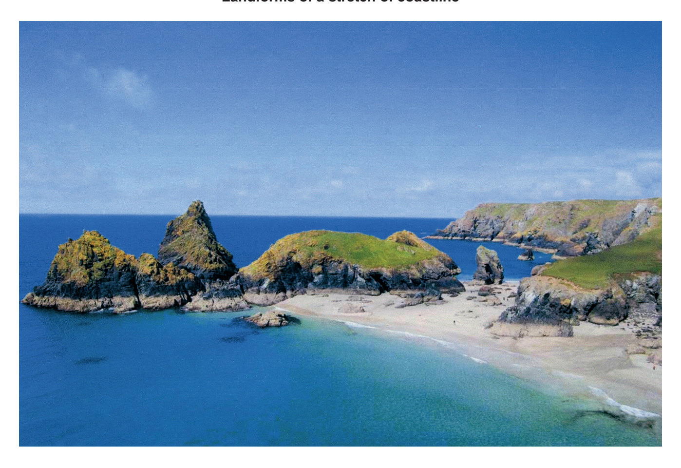
Photograph B for Question 5