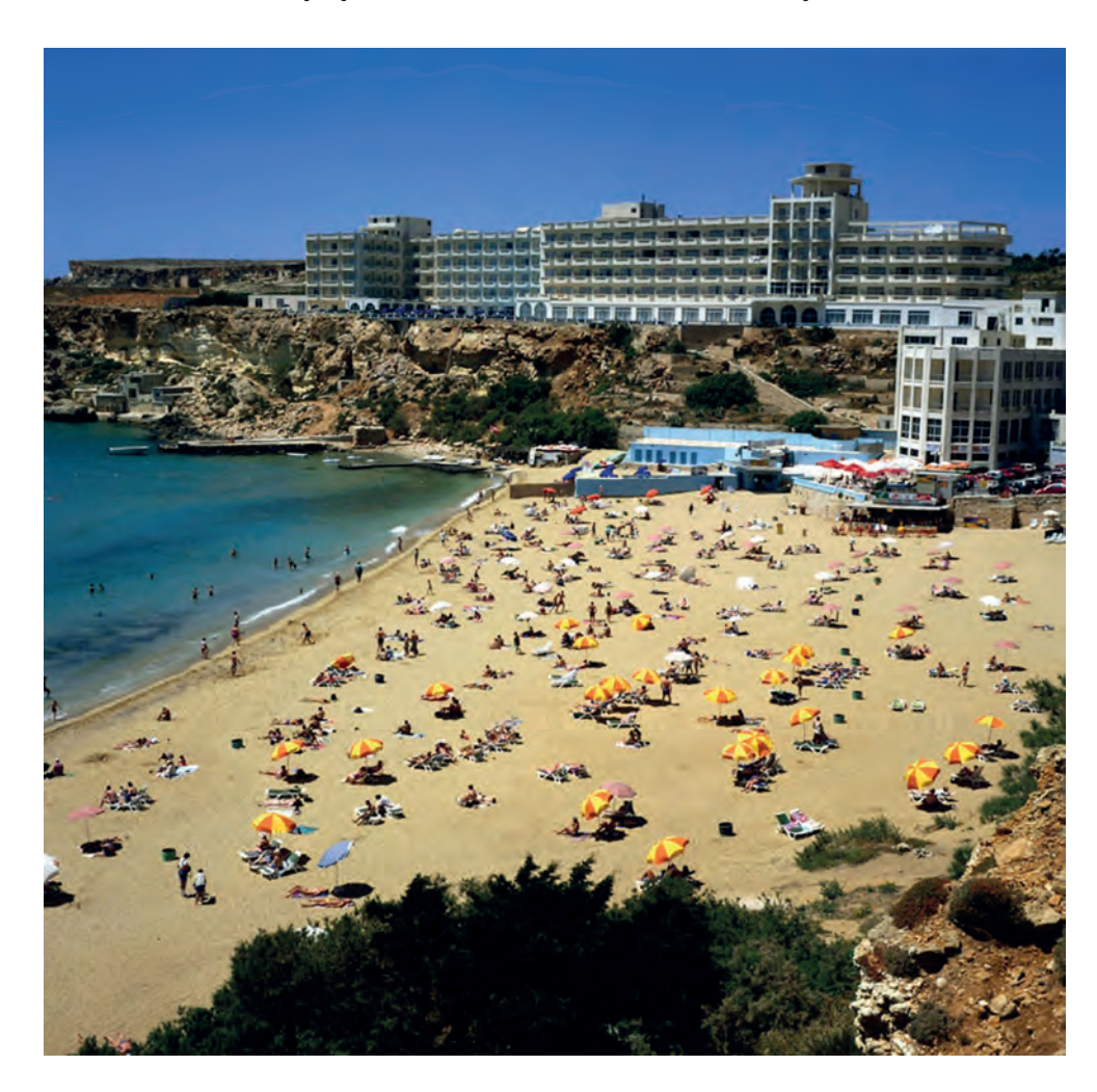
Photograph A for Question 6 A popular tourist destination in Europe