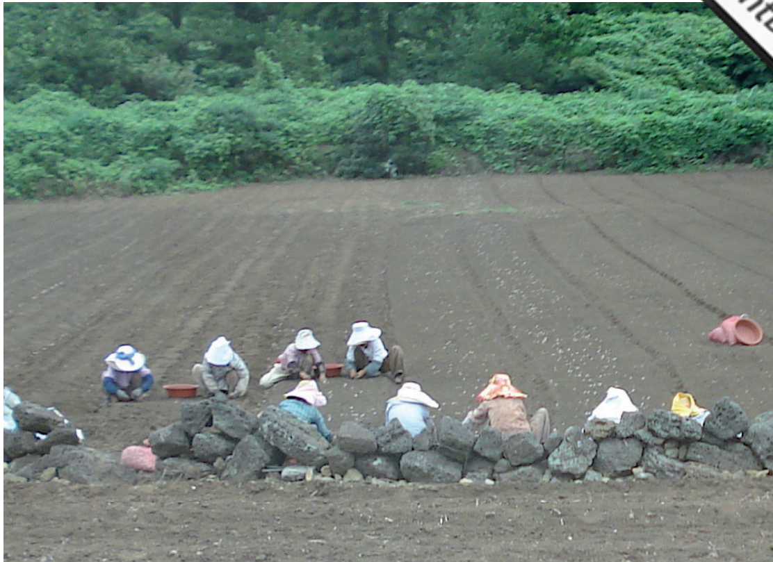
Traditional women workers picking stones from agricultural land in South Korea