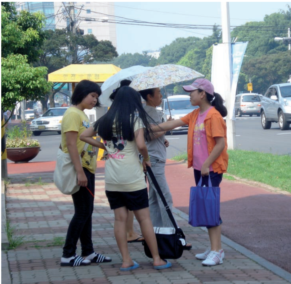
Modern urban South Korean women