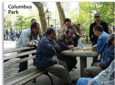
Sources: Map drawn from freely available sources Photographs: the Chief Examiner