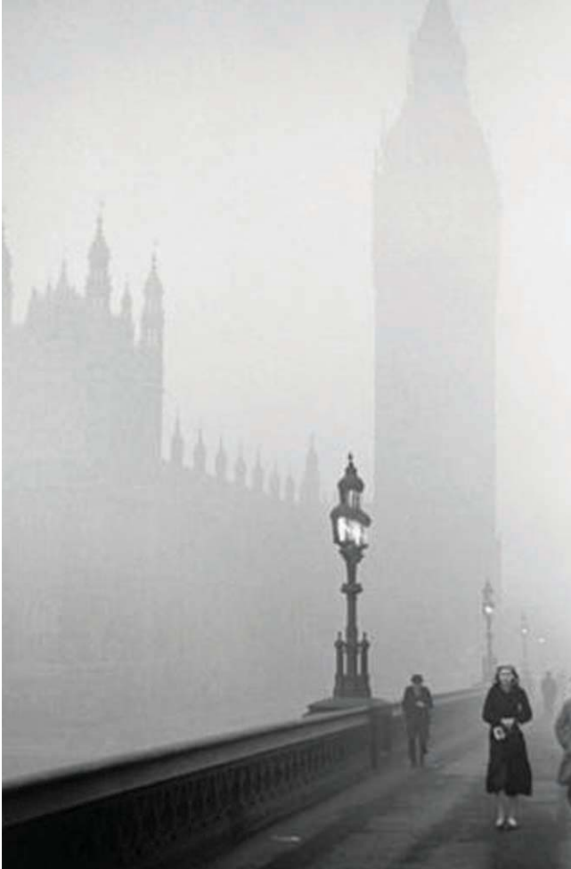
Figure 5 (Present day)