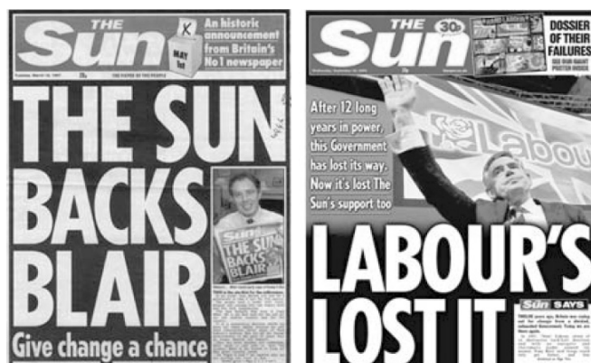
The Sun's front pages from 1997 and September 2009.

Today saw a crushing blow to Labour as The Sun turned its back on the party and threw its weight behind the Conservatives with a front page headline: 'Labour's Lost It'. The paper said: 'After 12 long years in power, this government has lost its way. Now it's lost The Sun's support too.'