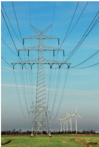
Figure 1: Electric companies use a diverse mix of fuels to generate electricity

(2) The increasing interest in nuclear power is underscored by the fact that George W. Bush was the most pro-nuclear power president in two decades. He cautioned against US dependency on foreign energy in his State of the Union address in both 2006 and 2007. He introduced the Advanced Energy Initiative which, among other things, set up a Global Nuclear Energy Partnership under the Department of Energy (DOE). It was intended to not only reduce America's dependence on foreign fossil fuels but also encourage emissions-free nuclear energy world wide. The DOE is seeking to develop new technologies to recycle nuclear fuel, minimise waste and keep nuclear fuels out of the hands of terrorists.