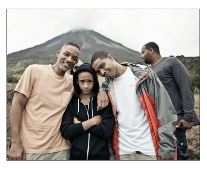
- adapted from www.grantland.com