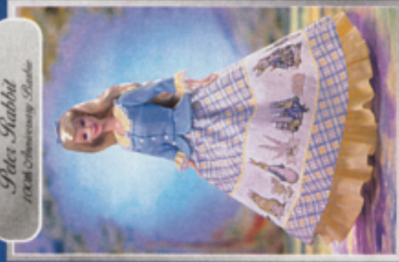
Peter Rabbit 100th Anniversary Barbie

6 Peter Rabbit 100th Anniversary Barbie.