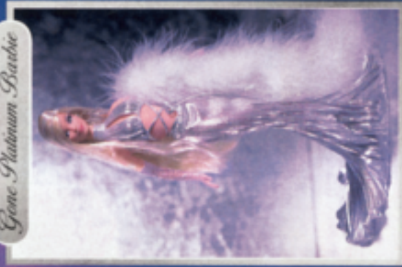
Gone Platinum Barbie