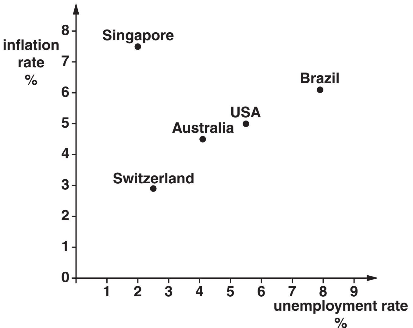
FIG. 2 THE RELATIONSHIP BETWEEN THE UNEMPLOYMENT RATE AND INFLATION RATE IN SELECTED COUNTRIES IN 2008

The Australian government, like other governments, seeks to promote economic growth because of the benefits that can be gained. The Australian growth rate in 2008 was 2.7%. In the short run, economic growth may be stimulated by demand-side policies; but in the long run, supply-side policies may be more significant.