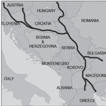
Proposed route for Corridor X