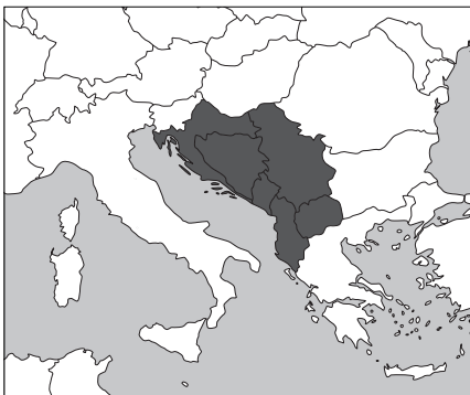
The Western Balkans