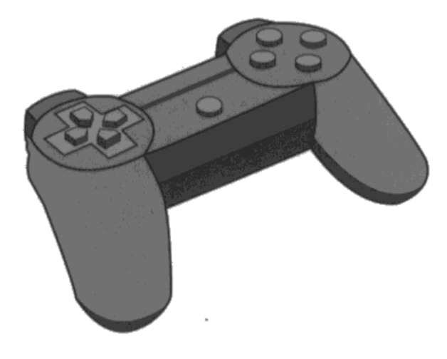
Figure 1 shows the handset controller for a games console.

A common mistake was for candidates to start to consider elements of the design that were not evident in the illustration rather than working with the information provided for examples materials and textures.