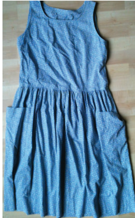
Lightweight cotton dress