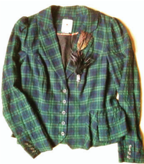
Wool tartan jacket