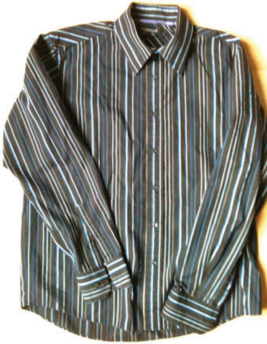
Man's striped cotton shirt