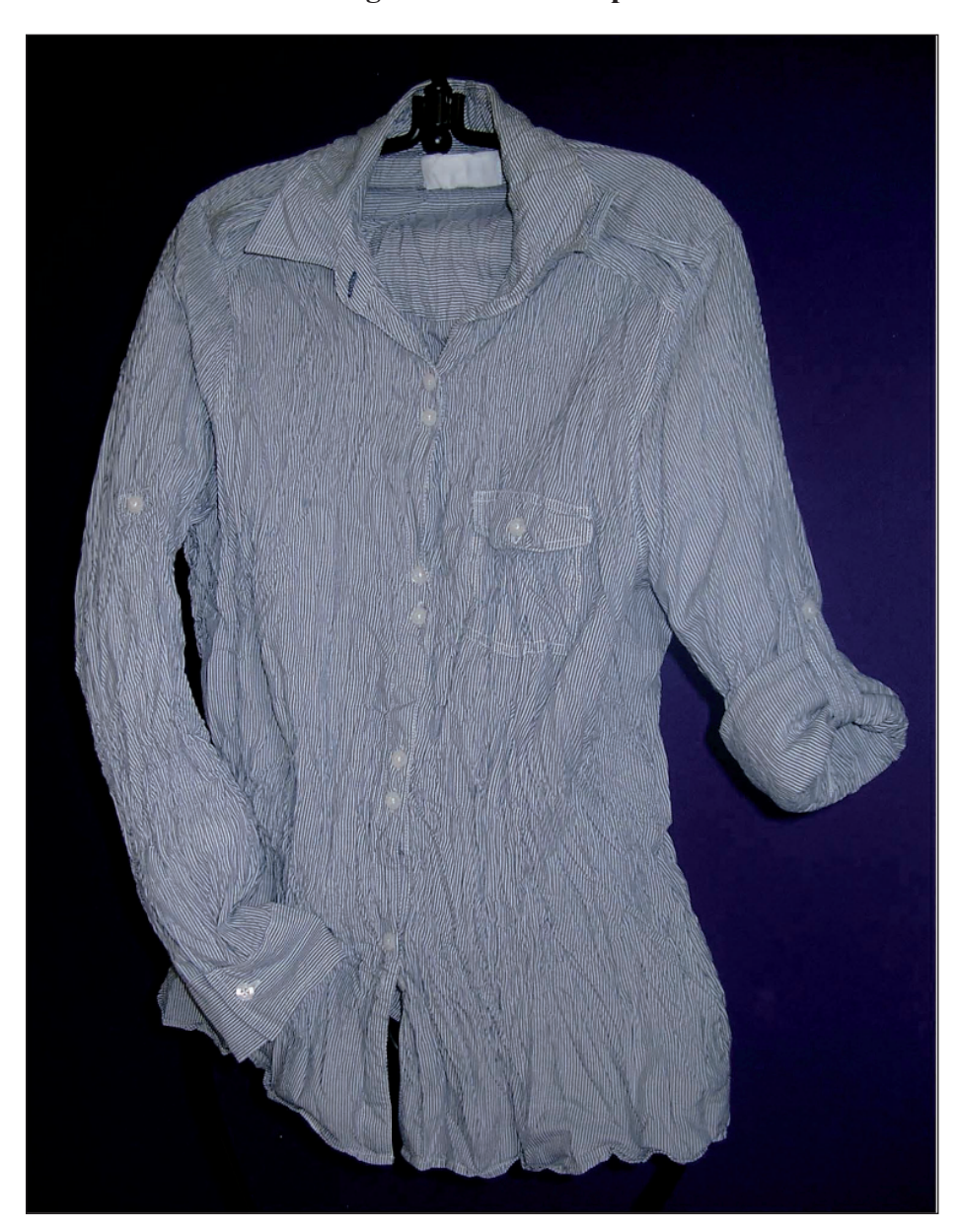
Figure 5 Fashion top

ACKNOWLEDGEMENT OF COPYRIGHT-HOLDERS AND PUBLISHERS