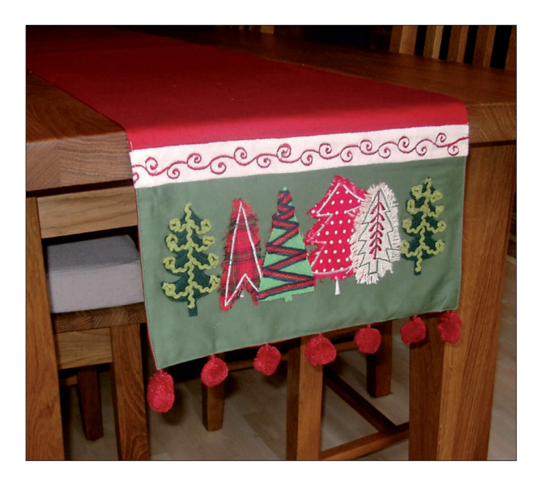
Figure 2 Detail of decoration on table runner