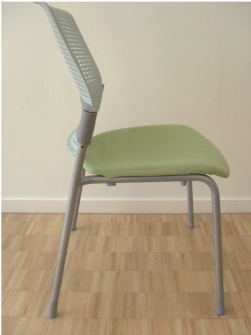
Figure 2 Chair