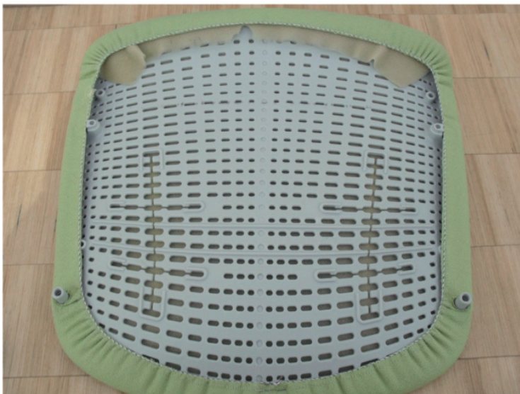
Figure 4 Underside of detached seat pad