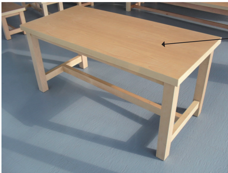
Figure 1 School dining table To be used when answering Question 7

Part A MDF table top covered with a laminate