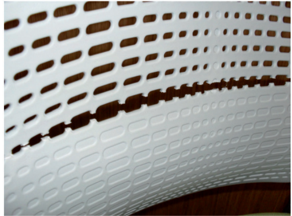
Figure 3 Close up of backrest detailing the split referred to in question 8 (b)