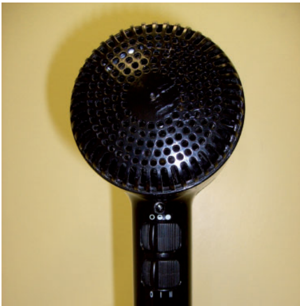
Figure 6 Back view