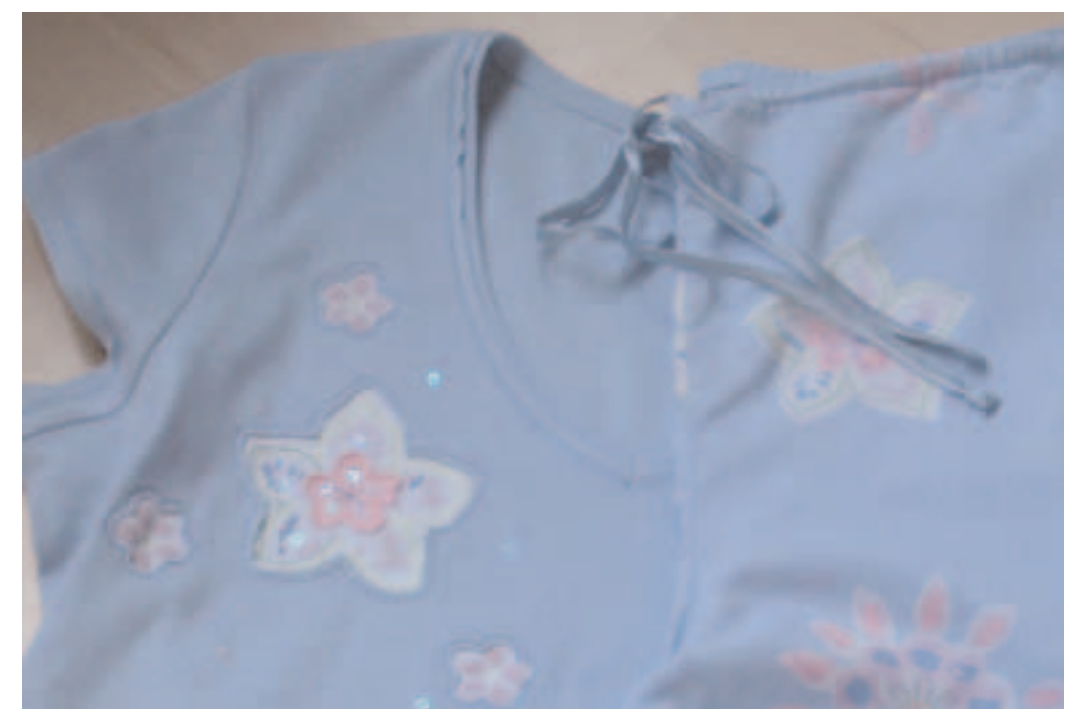
Close-up view of Style A pyjamas

Cotton jersey top. Printed woven cotton bottoms have adjustable elasticated waistband.