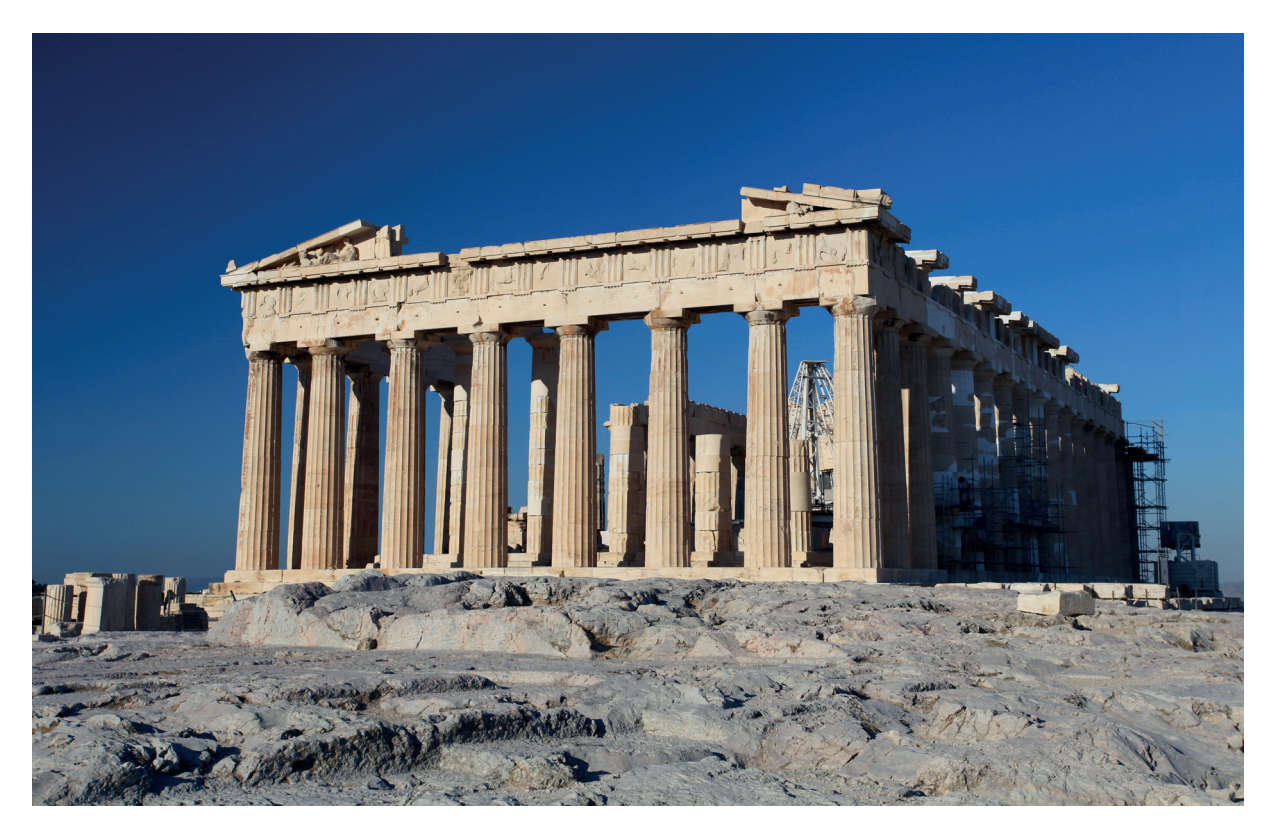
The Parthenon on the Acropolis, Athens

2 Study the photograph and answer the questions.